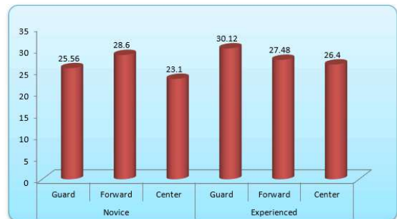
FIGURE – I: DISPLAYS SPORTS ACHIEVEMENT MOTIVATION OF ELIMINATION ROUND PLAYERS

There is a significant consequence on player level. At F(1,114) = 10.17, p.05. , qualifying round players ( M=28.40 ) stimulated considerably complex sporting execution impulse than elimination round players ( M=26.41 ). There was also a main sway on player position. At F(2,114)=6.99, p.05. , midfielders were found to have significantly higher sports achievement motivation ( M=27.76 ), followed by forwards ( M=27.60 ) and defenders ( M=24.75 ). There was also a significant interface amongst level and position, with F(2,114) = 8.56, p.05 . Figure I depicts the mean values of sports accomplishment motivation by player level and playing position.